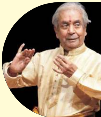
Pt. Birju Maharaj

'Kathak Mahotsava' is an annual prestigious event of Kathak Kendra, New Delhi in which Kathak Dancers and Choreographers of the National repute are invited to perform and present their work. Kathak Mahotsava is being organized every year since 1977. The festival attempts to explore new areas of Kathak as manifested in larger but identical traditions found in other linguistic regions of the country.